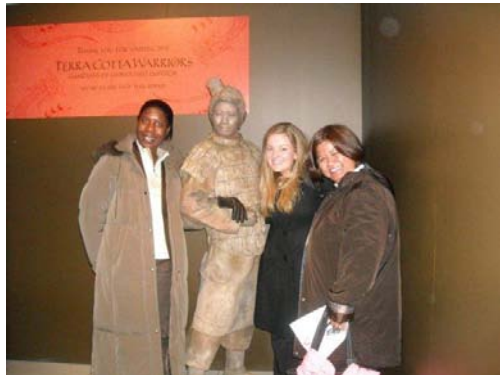
BOILA employees enjoying cultural moment.

Recently, our law firm members enjoyed the National Geographic exhibit of magnificently life-sized warriors and artifacts from the Bronze Age of China.